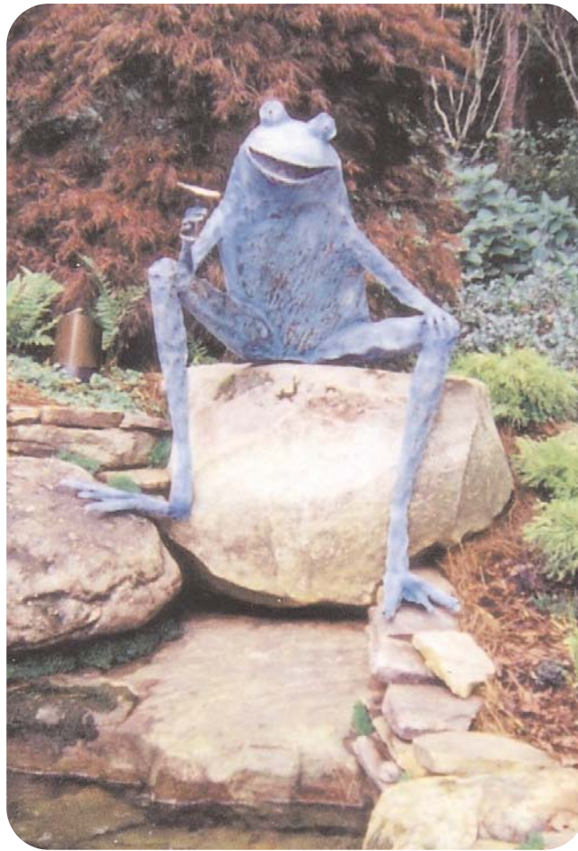
Beau Smith's Martini Frog 2 (above) and Bass Frog

Don't do that unless the work of craft has sentimental value or is in some other way exceptional to you. Craft is cheaper than art: cheap in price and cheap in QUALITY . Instead, buy less and get more. If you can only afford one original work of sculpture, do that rather than buy many craft pieces. Your outdoor landscape is not going anywhere and neither is the art, especially if you secure it, which you should, and which it is possible to do without making such securing