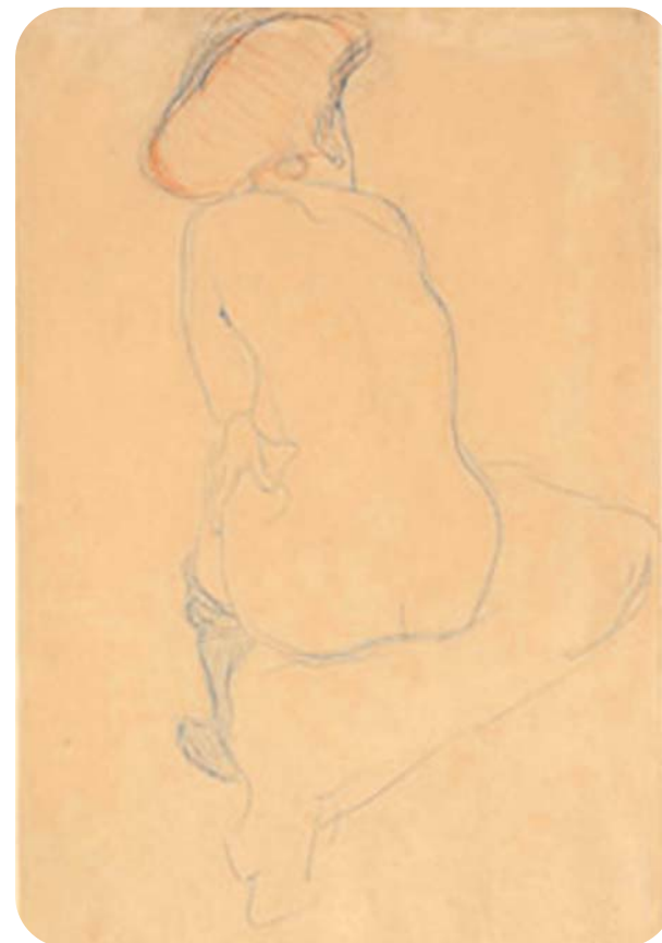
Gustav Klimt, "Woman Lying Half Draped", n.d., graphite on paper, Gift of the Ernst Pulgram and Frances McSparran Collection, 2007/2.88

Museum's mission is the care, interpretation, and strategic growth of its permanent collection. In order to continue to have funds for the purchase of new works of art, in fulfillment of its mission, the Museum has adopted and begun the implementation of a deaccession plan to increase funds for art acquisition. Objects for sale include the Museum's warehoused costume collection, rug collection, books, and selected works from storage that have rarely been displayed or are no longer consistent with the mission of the Museum. ➤