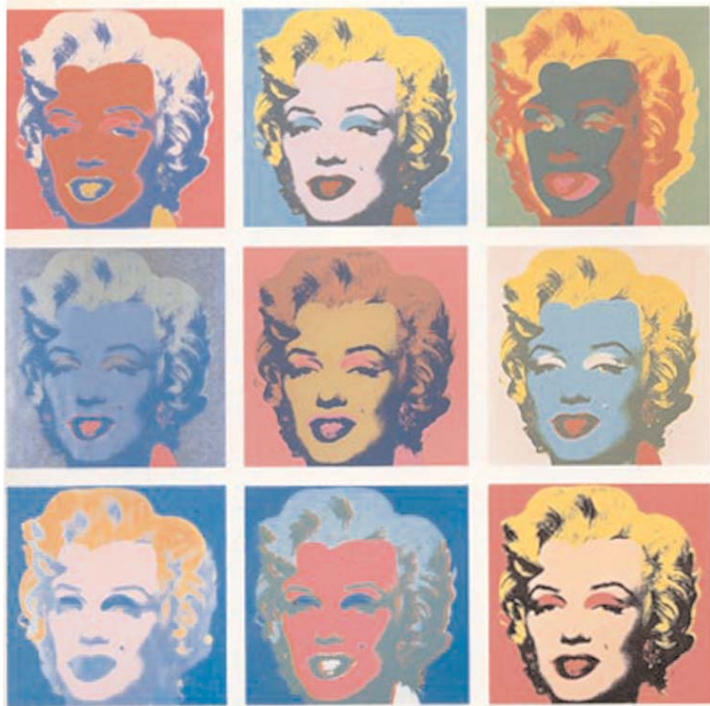
Andy Warhol, "Marilyn Monroe"

Looking back in time it has become obvious that Warhol marked a change in the modern art world. His work, his paintings and prints are still very popular. ➤