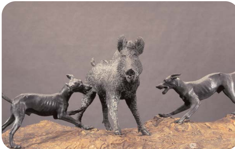
Boar Attacked by Dogs , 1st century BC – 1st century AD, bronze, Pompeii, House of the Citharist, from central garden, Museo Archeologico Nazionale di Napoli

Awards: cash, merchandise, gift certificates.