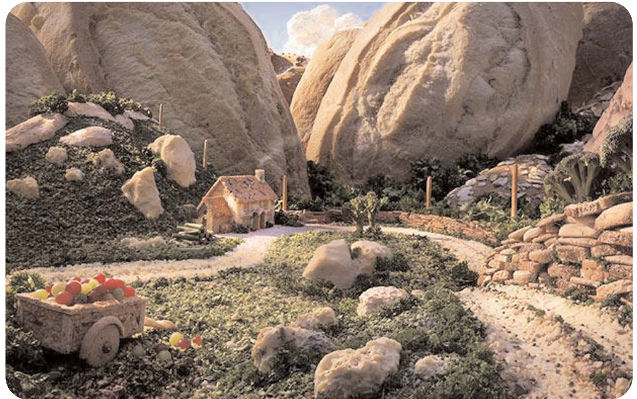
Foodscape by Carl Warner