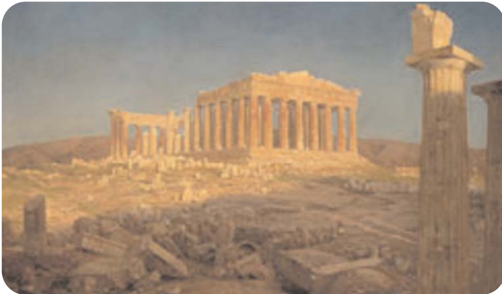
Above: Frederic Edwin Church, The Parthenon , 1871, oil on canvas, 44.5 x 72.625", The Metropolitan Museum of Art

A major international exhibition opening this fall at the Cleveland Museum of Art explores a watershed moment of transformation in Gauguin's career that introduces the themes, motifs and the style that would emerge as hallmarks of his career. Featuring more than 75 paintings, sculptures, and works on paper by Paul Gauguin and his contemporaries, Paul Gauguin: Paris, 1889 , is the first exhibition to focus on 1889 as a critical juncture in Gauguin's artistic development. Paul Gauguin: Paris, 1889 is on view at The Cleveland Museum of Art (CMA) from October 4, 2009 through January 18, 2010; it will then travel to the Van Gogh Museum in Amsterdam. www.ClevelandArt.org