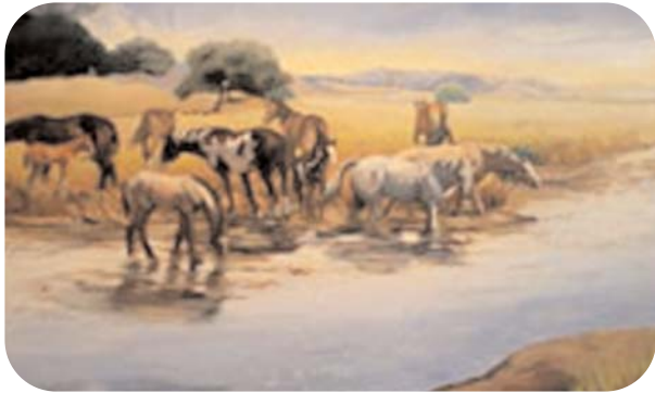
The 2008 Western States Horse Expo People's Choice, Untitled by Sarah Lam of Sacramento, California