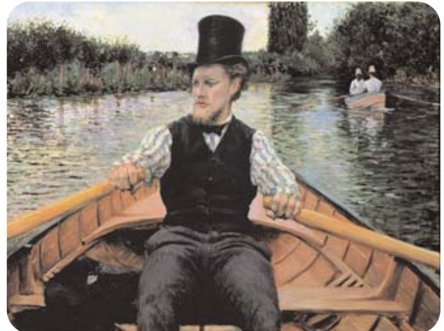
Gustave Caillebotte (French, 1848-1894). "Oarsman in a Top Hat", 1877-78. Oil on canvas, 35 7/16 x 46 1/16 in. (90 x 117 cm). Private collection

Impressionist Paintings from Paris to the Sea presents the artist's well-known Parisian cityscapes alongside his painted scenes of outdoor life on the coast of Normandy and in the rural villages of Yerres and Petit Gennevilliers, where he and his family maintained estates. The exhibition will explore for the first time how these paintings express Caillebotte's passion for