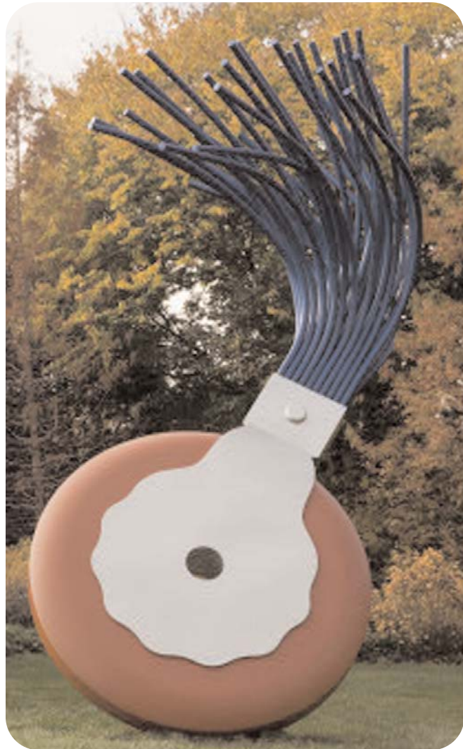
Claes Oldenburg and Coosje van Bruggen, "Typewriter Eraser, Scale X, model 1998", painted stainless steel and fiberglass, fabricated 1999, Gift of The Morris and Gwendolyn Cafritz Foundation 1998.150.1 National Gallery of Art

Like Dada before it, the pop art movement used common items as its subject matter and the artists preferred commercial methods of production thus allowing unlimited reproductions of the art. As