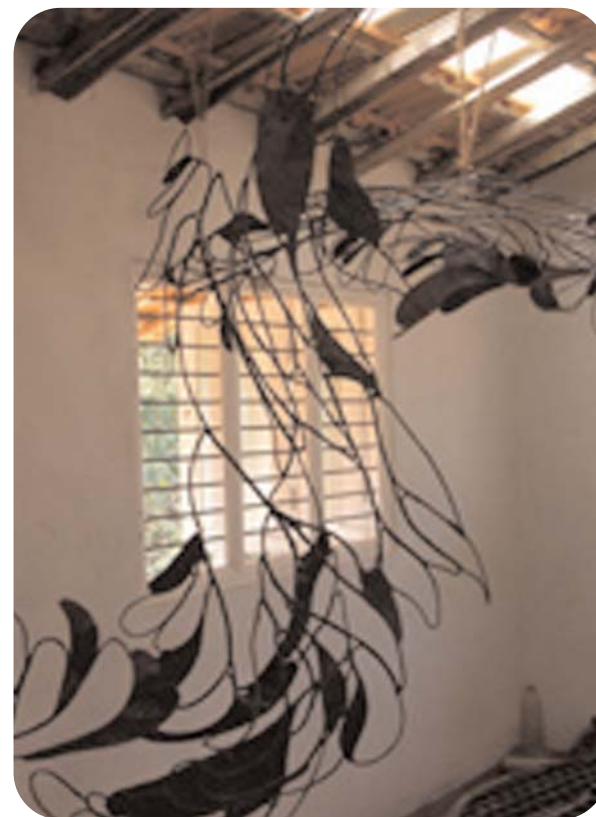
Ranjani Shettar, "Sing along", 2008-9; Stainless steel, muslin cloth dyed in kasimi, gum arabic and lacquer, Courtesy of the artist and Talwar Gallery New York / New Delhi

The exhibition will include two works crafted specifically for SFMOMA. Waiting for June (2008-9) is made of wrought iron, and Sing along (2008-9) is composed of a steel armature wrapped in a dyed black muslin cloth and glued with tamarind kernel powder paste. Three large-scale woodcut prints made in 2006-