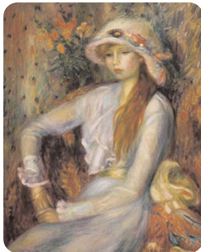
William Glackens, "Julia's Sister", c. 1915, oil on canvas, Terra Foundation for American Art