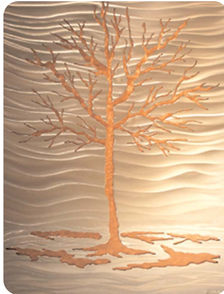
Above: "fire lake", indoor/outdoor wall hanging sculpture, ground copper & ground aluminum, 36 x 24 x 2 inches